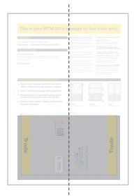
Step 3 Fold along middle