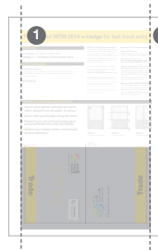
Step 1 Fold back along edges